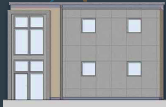
Indicative Illustration - East Elevation